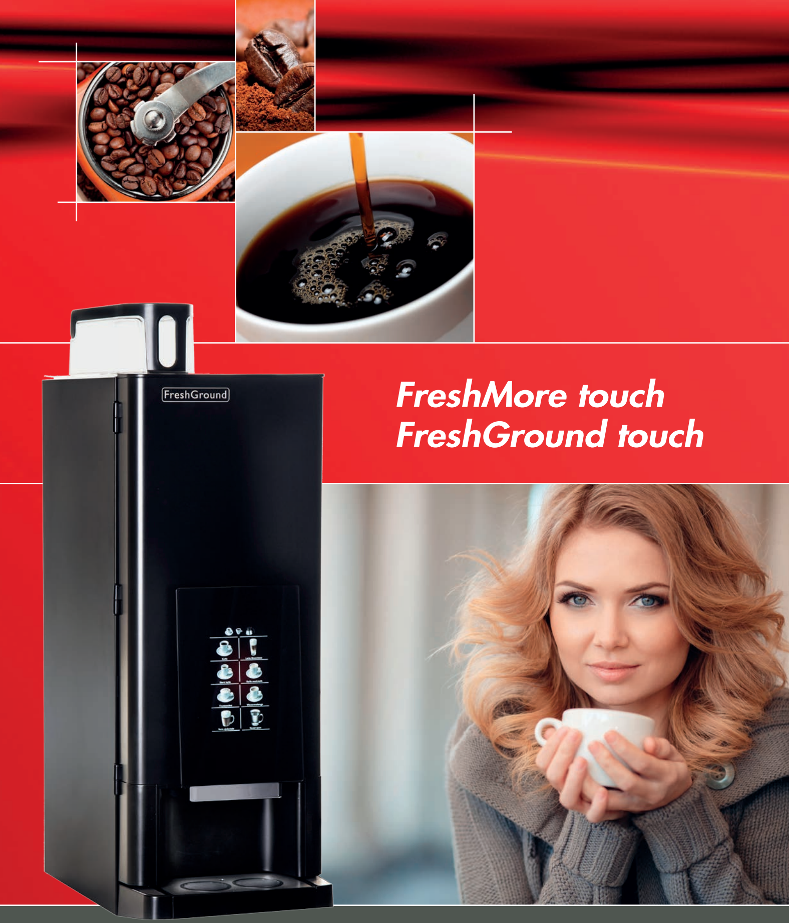
The taste of quality worldwide