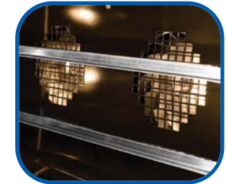
Powerful twin fans ensure even cooking