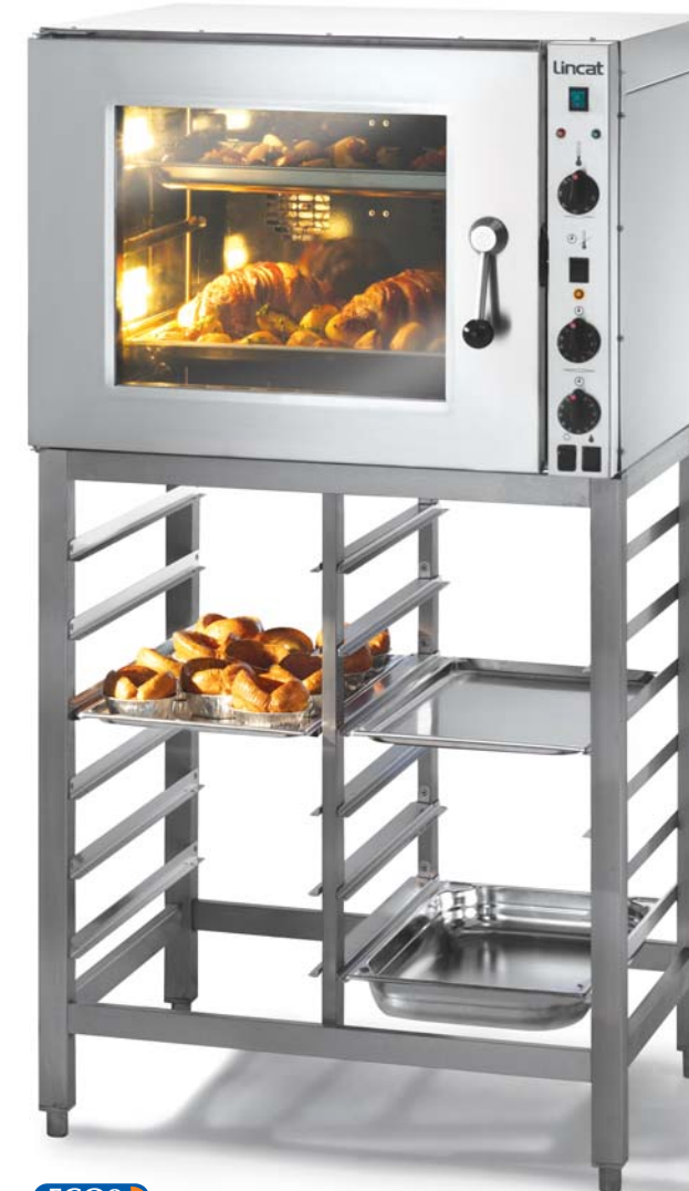
ECO8 With optional stand (ECO8/FS)