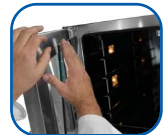
Removable inner door glass for easy cleaning