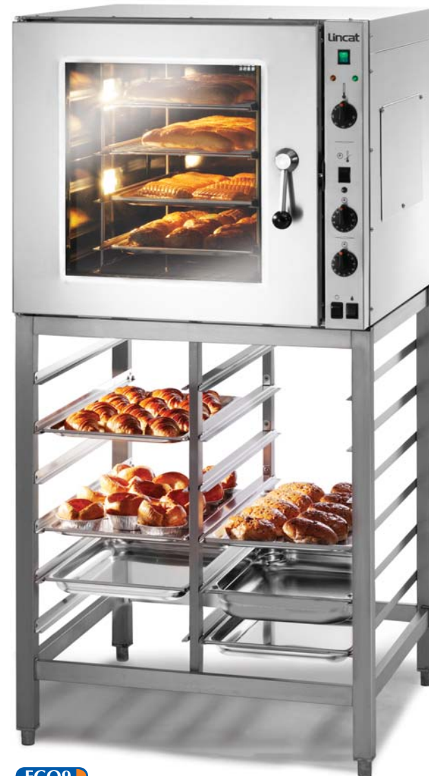
ECO9 With optional stand (ECO9/FS)