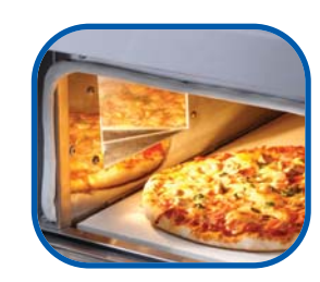
Internal illumination for better visibility of product