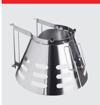
Removable safety guard in stainless steel. CE-certified