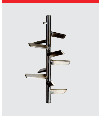
Powder mixer with double pin, stainless steel