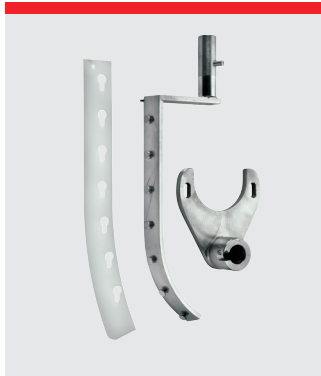
Automatic scraper, stainless steel. Nylon or teflon blade. 100L 100/60L and 100/40L.