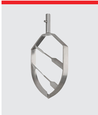
Beater with double pin, aluminium