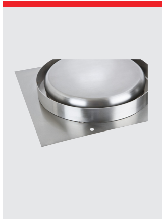
Double chimney, stainless steel, IP54