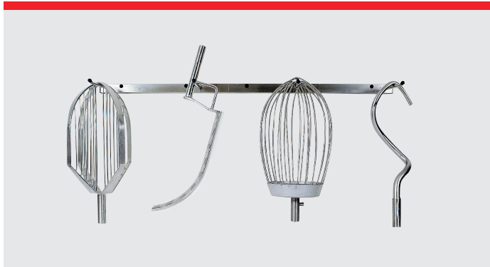
Tool rack, 127 cm