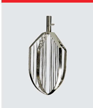
Wing whip with double pin, stainless steel