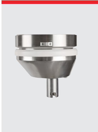
Waterproof planetary head, stainless steel, IP54