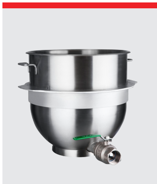
Bowl with bottom draining pipe, stainless steel