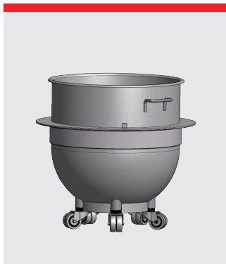
Wheels for bowl