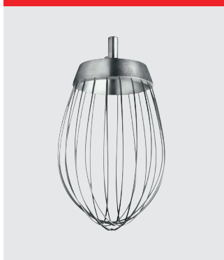
Whip with double pin, with thinner wires, stainless steel