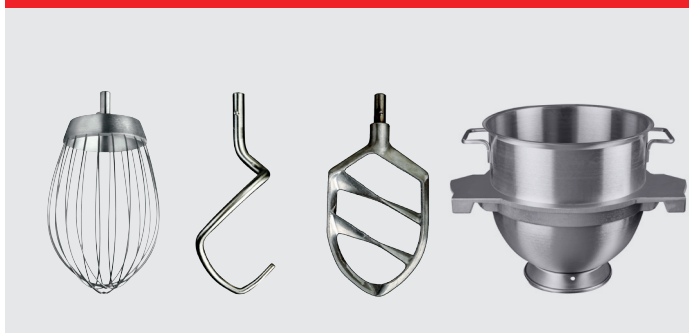
Whip, hook, beater and bowl 100/60 liter in stainless steel and Whip, hook, beater and bowl 100/40 liter in stainless steel.