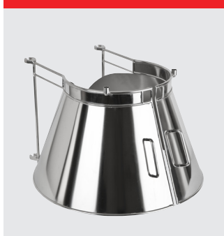
Removable splash guard in stainless steel. CE-certified