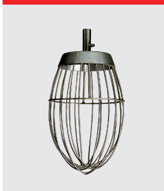
Whip with double pin, with reinforcement