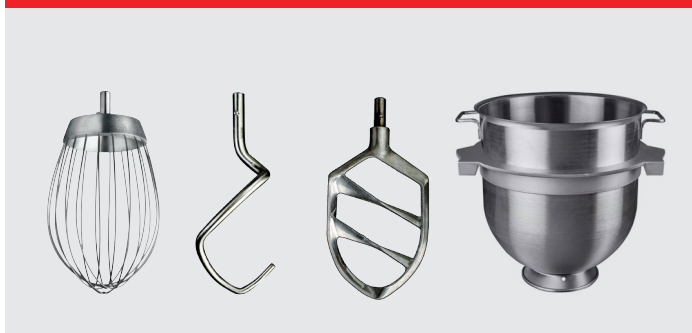
Whip with double pin, hook with double pin, beater with double pin and bowl 100 liter in stainless steel.