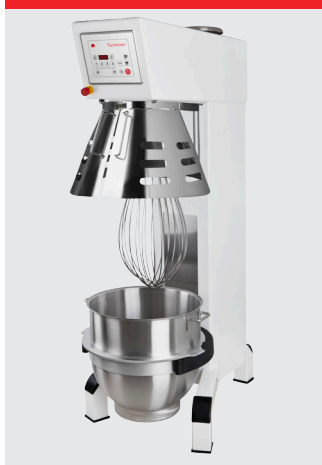
White, powder coated